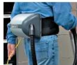
Padded belt is adjustable for operators comfort