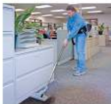
Edge cleaning is done easily with the Adgility