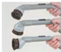
Rotating dust brush positions bristles for cleaning multiple surfaces