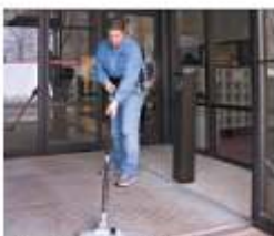
Combination floor tool is easy to use on hard or soft floor