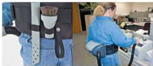
Detail cleaning on the go is easy with handy crevice tool and bristle brush