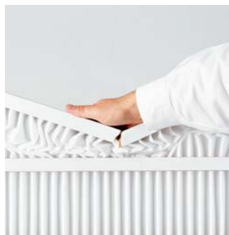
As a result of its unique design, PerfectPleat can withstand significant damage.

With the superior resiliency of DuraFlex media and no need for wire support, the PerfectPleat can sustain significant abuse and maintain its shape and pleat spacing. The absence of the wire also makes the filter totally incinerable, which simplifies disposal. The PerfectPleat meets or exceeds all current expectations for service life.