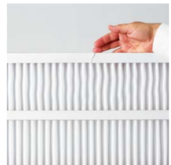
DuraFlex media has "memory" which allows PerfectPleat to remain functional, even when the frame has been compromised.