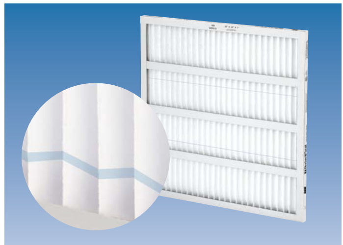
PerfectPleat M8, 1" thick, air leaving side. A blue stripe designates PerfectPleat M8 media.

The 1" PerfectPleat M8 and PerfectPleat have the same durability and performance as the 2" models. Both are made using DuraFlex media encased in a 28 pt. beverage carrier board frame. PerfectPleat 1" models feature a perimeter frame, with three supporting straps on the air entering and air leaving sides of the filter. Both models resist crushing and abuse and can be used in any application where 1" filters are currently in place. PerfectPleat M8 is rated MERV 8 and PerfectPleat rates MERV 7.